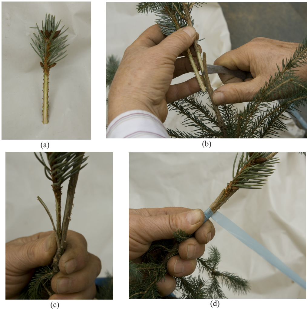
Figure 3 Illustration of the double-side-veneer grafting: (a) the scion was prepared with 4-5 cm long cut on both sides; (b) the rootstock cut preparation; (c) the scion was inserted into the rootstock cut; (d) the grafting partners are tightly tying with plastic tape then the Ceraltin ® wax will be applied (original photo I. Blada).

exceeded the above mentioned values; consequently, some losses in grafted plants have occurred. In such days, artificial misting was done inside the greenhouse.