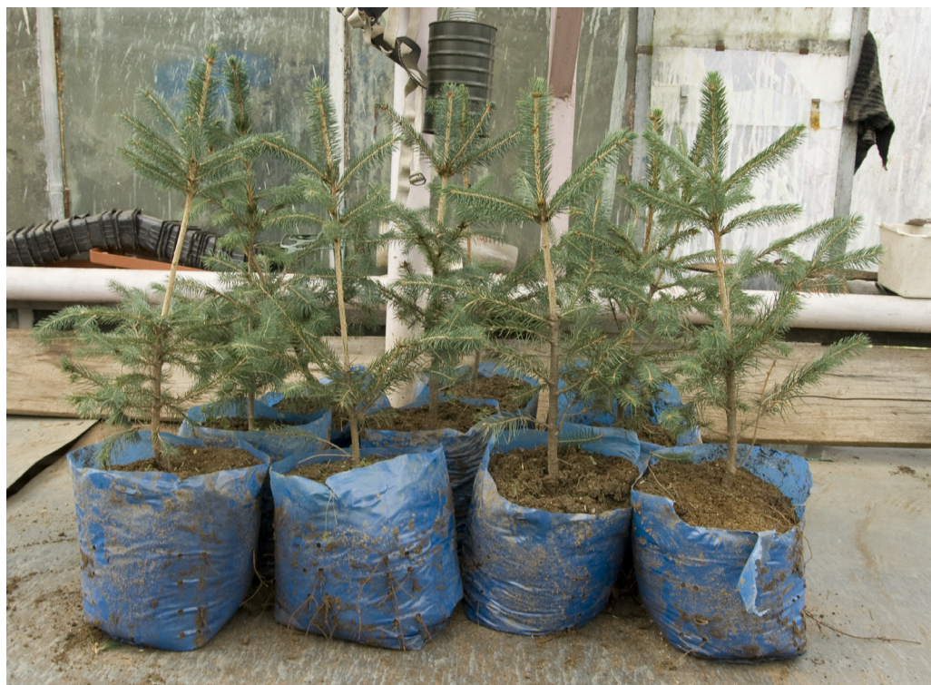
Figure 1 Sample of silver spruce rootstocks prepared for grafting

The grafting materials tested by this experiment were the plastic tape and the ecological Ceraltin® wax. The following grafting tapes were applied on the joined rootstock - scion: